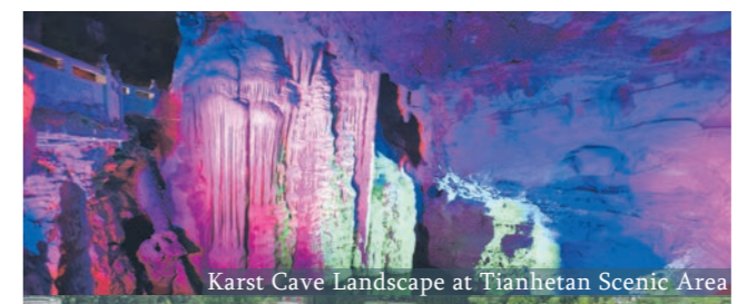
Karst Cave Landscape at Tianhetan Scenic Area

Revolutionary landmarks, Confucian philosophy-related locations, and geoparks make Guiyang a platform to grasp revolutionary ethos, delve into the meaning of life, and explore natural wonders.