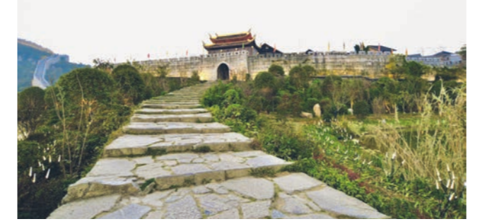
Qingyan Ancient Road, A Vital Channel for Tea-Horse Trade

A thousand years ago, following the Song Dynasty, the historic Qingyan Ancient Road emerged as a vital channel for tea-horse trade and commerce.