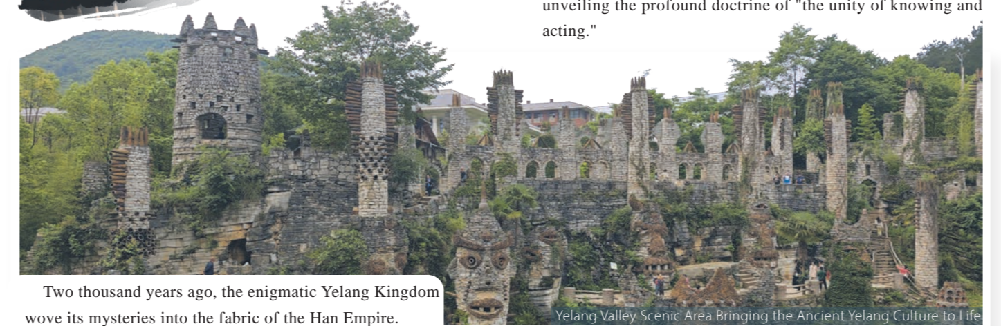
Two thousand years ago, the enigmatic Yelang Kingdom wove its mysteries into the fabric of the Han Empire.