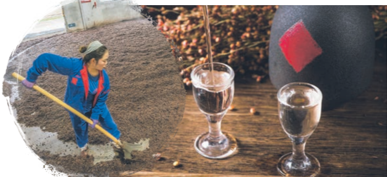
Moutai-flavored Baijiu and Workers in a Baijiu Production Workshop

The city boasts exceptional local liquor and tea. Green mountains and clear waters yield fine liquor, while Guizhou tea shines with its excellent flavors.