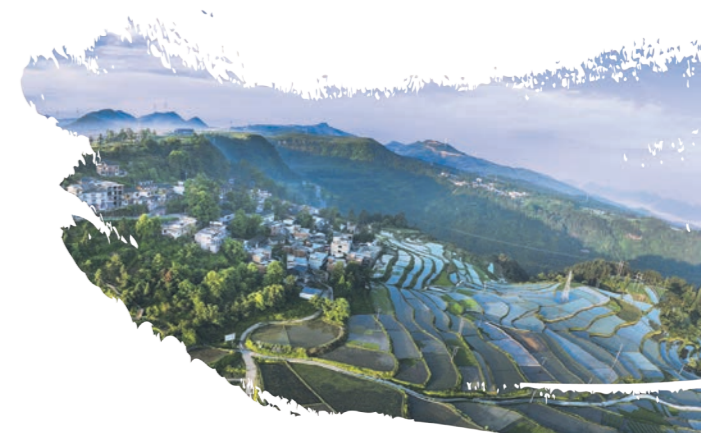
Terraced Fields in Gaopo Township, Huaxi District

Medicinal valleys, oxygen-rich environments, and mineral springs make Guiyang a good destination for healthcare services, migrant-style tourism, and health promotion.