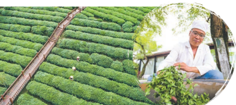
Kaiyang County's Yunshan Tea Sea Garden and Tea Masters