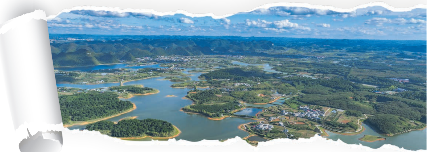
Vast Stretches of Hongfeng (Red Maple) Lake