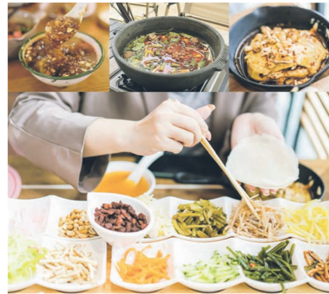
Porridge with Glutinous Rice Cake, Duoduo Bean Jelly Hot Pot, Spicy Tofu Puff, and Siwawa Spring Roll (Shredded Vegetables Wrapped in Thin Rice-Flour Pancakes)

The spicy taste forms the cornerstone of Guiyang cuisine.