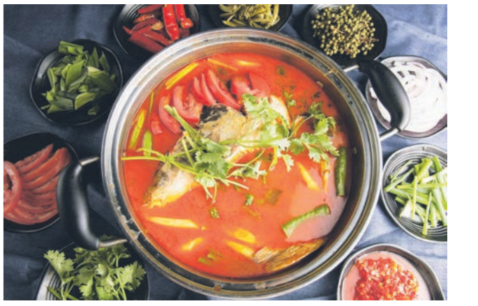
Fish in Sour Soup Stimulating the Appetite

The dynamic blend of sour and spicy tastes and delectable flavors lead to unique and diverse local culinary delights in Guiyang.