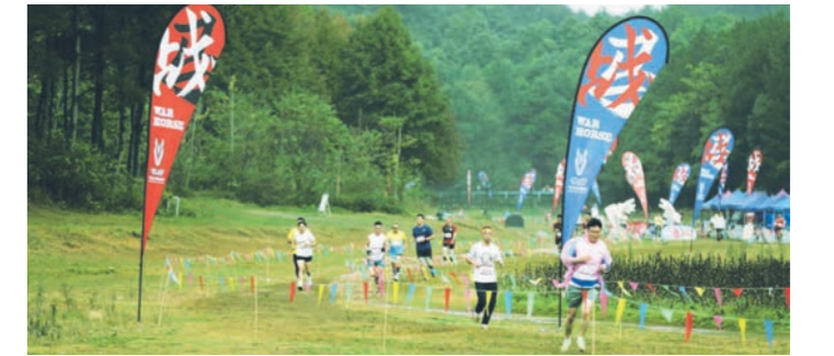
Citizens Participating in the "Cool Guiyang" Fitness Trail Competition at Changpuling Forest Park