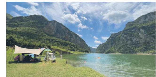
Pristine View of the Yachi River in Summer Making It an Ideal Destination for Camping and Relaxation

Peculiar peaks and cliffs, crystal-clear streams and waterfalls, and hidden gullies and secluded caves make Guiyang a paradise perfect for rock climbing, drifting, camping, and various mountain sports.