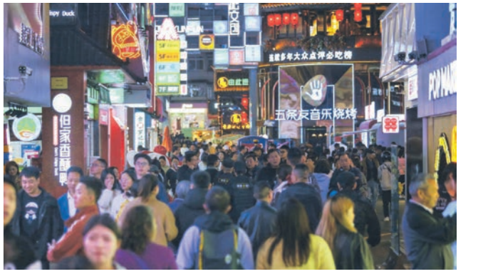
A Bustling Scene at Qingyun Market

The dynamic blend of sour and spicy tastes and delectable flavors lead to unique and diverse local culinary delights in Guiyang.