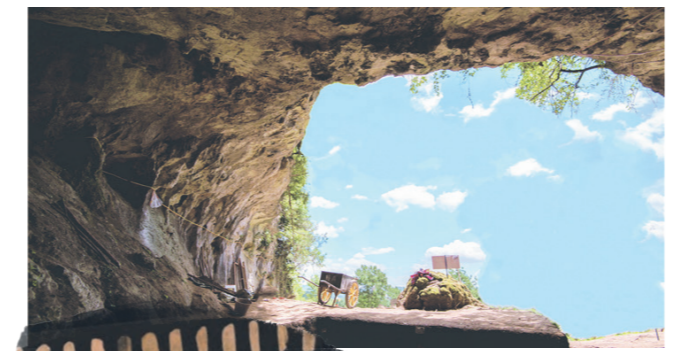
Zhaogudong Cave Site and Some Bone and Horn Artifacts Unearthed There

Forty thousand years ago, the ancestors of Guizhou settled in Zhaogudong Cave, Gaofeng Town.