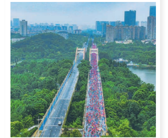
2024 Guiyang Marathon

Guiyang people, with the best knowledge of the harmony between humanity and nature, have deeply immersed the balanced urban living and natural surroundings into their blood and soul.