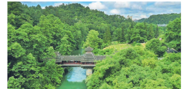
Aha Lake National Wetland Park Surrounded by Forests