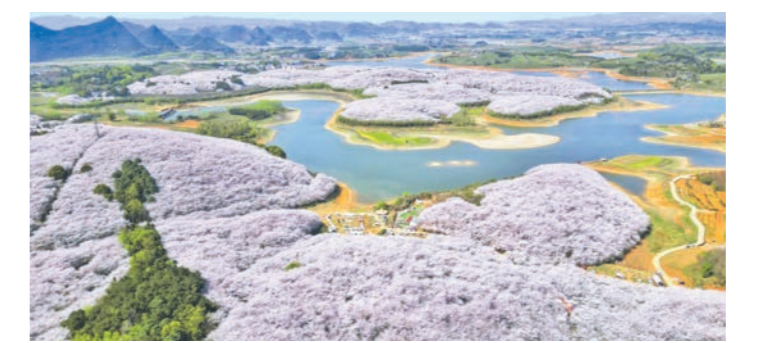
Gui'an Cherry Blossom Park Spanning Over 10,000 Mu (about 667 hectares)