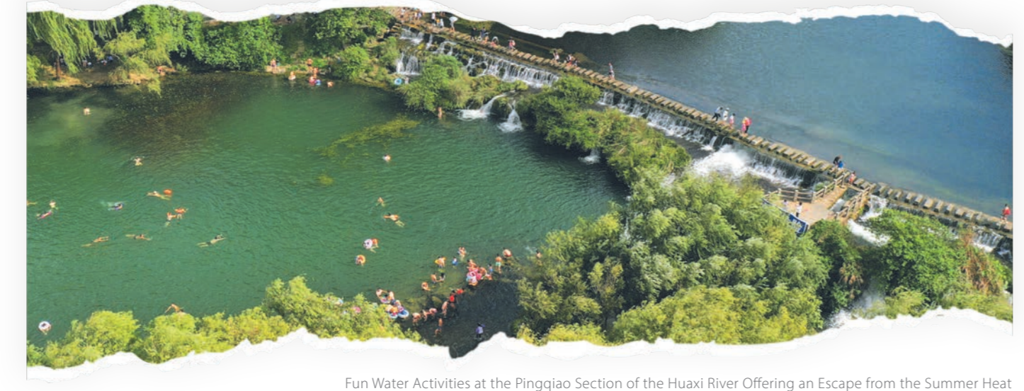
Fun Water Activities at the Pingqiao Section of the Huaxi River Offering an Escape from the Summer Heat