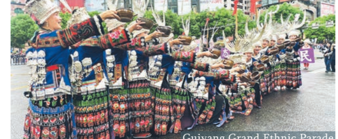
Guiyang Grand Ethnic Parade

Revolutionary landmarks, Confucian philosophy-related locations, and geoparks make Guiyang a platform to grasp revolutionary ethos, delve into the meaning of life, and explore natural wonders.