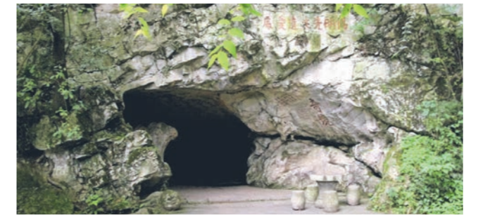
Yangming Cave Site

A thousand years ago, following the Song Dynasty, the historic Qingyan Ancient Road emerged as a vital channel for tea-horse trade and commerce.