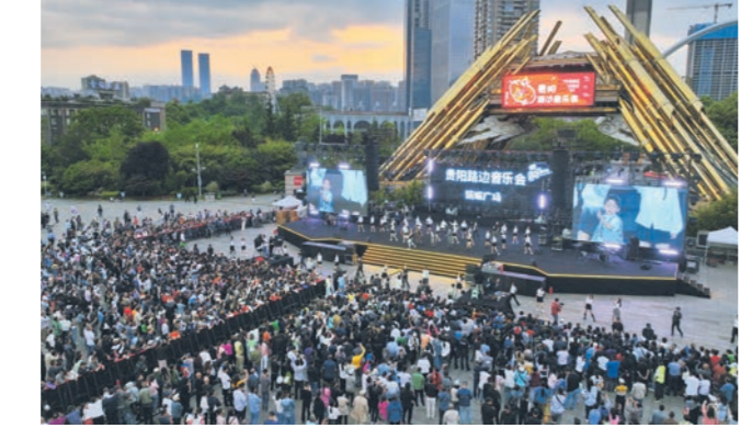
Five-Day Roadside Concert Held at Zhucheng Square, Guiyang, During the 2024 May Day Holiday