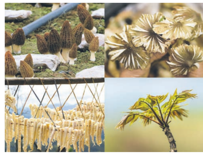
Morel Mushrooms, Collybia Albuminosa Mushrooms, Nan Bamboo Shoots, and Chinese Toon

The unique taste sets Guiyang cuisine apart.