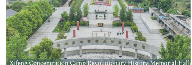
Xifeng Concentration Camp Revolutionary History Memorial Hall