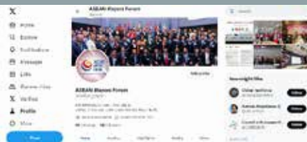
AMF X Account

X, formerly twitter, serves as a versatile social media platform for AMF to enhance its online presence, engage wider with cities and local governments of ASEAN, and achieve its communication, and organisation objectives. It also allows AMF to have direct engagement with the local governments in real-time, enables the AMF to address inquiries, provide support, and gather feedback, fostering a stronger ASEAN connection. Further, the AMF facilitates networking and collaboration opportunities for cities and local governments in ASEAN. https://twitter.com/AMF_uclgaspac