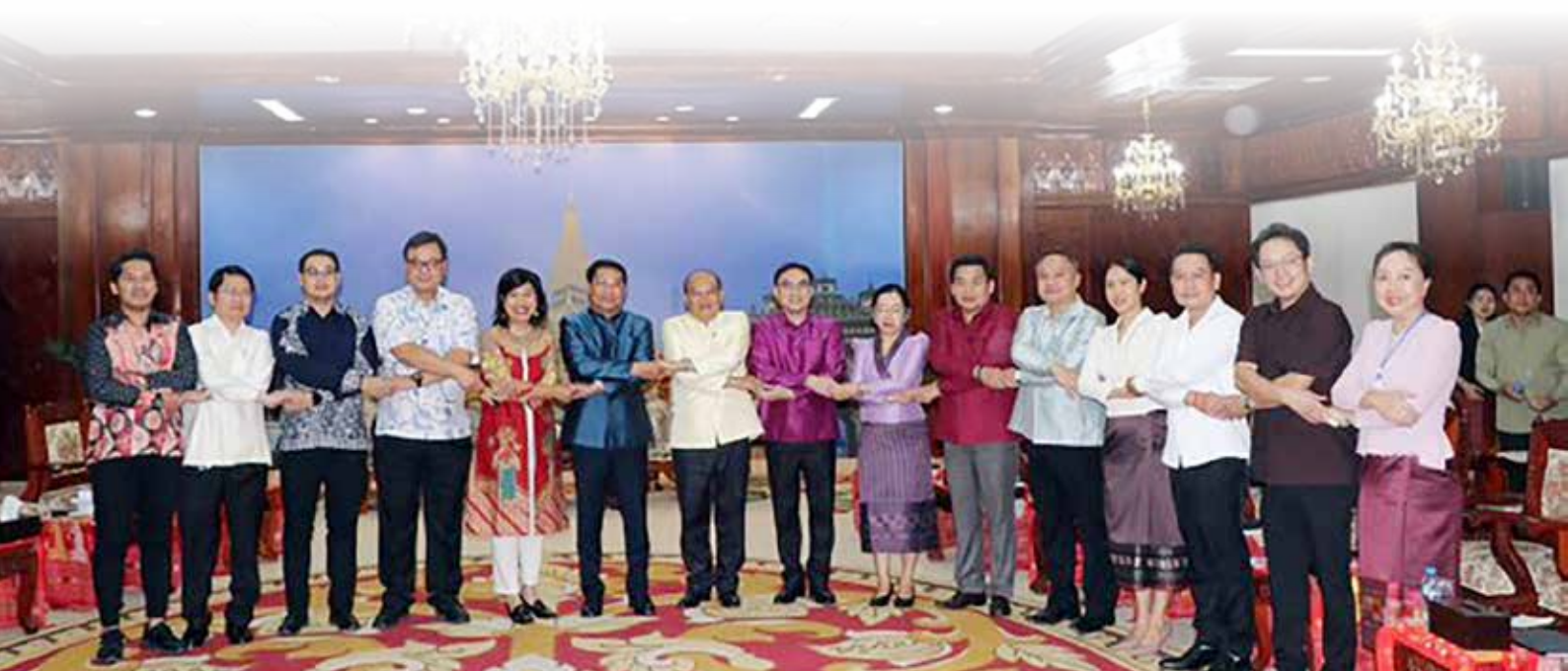
An agreement achieved between UCLG ASPAC and Vientiane for AMF/MGMAC 2024