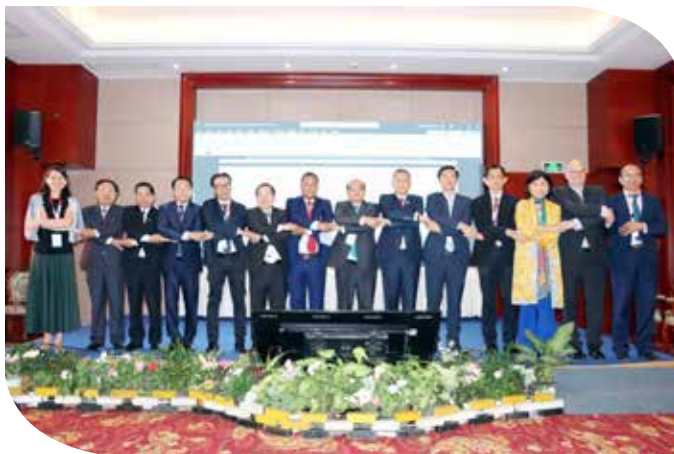
Expression of Commitment for Cooperation among Local Governments along the Mekong River Corridor

As one of the longest transboundary rivers in Southeast Asia, the Mekong Subregion is a naturally interconnected economic region of ASEAN five member countries: Cambodia, Lao PDR, Myanmar, Thailand, and Viet Nam, and home to nearly 65 million inhabitants (mrcmekong.org). It has a crucial role in transportation, tourism, biodiversity, and agriculture of the region. However, as the population residing in cities is projected to soar, challenges such as climate change, declining agricultural yields, water scarcity, biodiversity loss, and waste management need to be addressed.