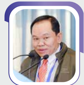
Mr. Bounnao shared the background of Lao ASEAN Chairmanship 2024.

Mr. Bounnao also shared the meaning behind the logo of Lao PDR ASEAN Chairmanship. The colours used in the logo represent the colours of the ASEAN Flag and Emblem: red, blue, yellow and white. The circular shape represents the globe and symbolises ASEAN’s relations and cooperation with external partners worldwide. This design element forms the letter “C” to symbolise “Connectivity”. This design element forms the letter “R” to symbolise “Resilience”.