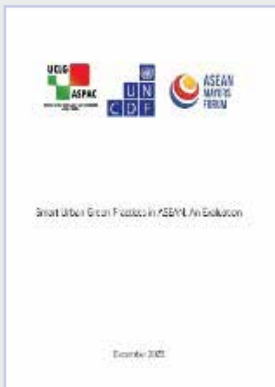
UNCDF-AMF Best Practice Report 2023

The cooperation between UCLG ASPAC/AMF secretariat and UNCDF aims to implement the “Smart Green ASEAN Cities” (SGAC) project. This ASEAN-wide initiative encourages sustainable urbanisation in ASEAN cities while lowering their environmental footprint, and raising citizens’ quality of life. The project’s specific goal is to encourage the adoption of green and smart city solutions throughout the ASEAN region. As part of the cooperation, the three thematic short case studies on smart green urban development practices were developed..