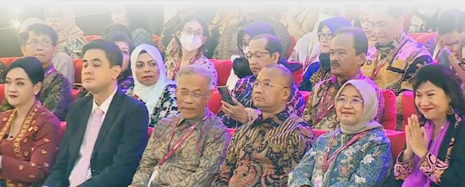
Distinguished delegates during the opening ceremony of OJK Seminar.