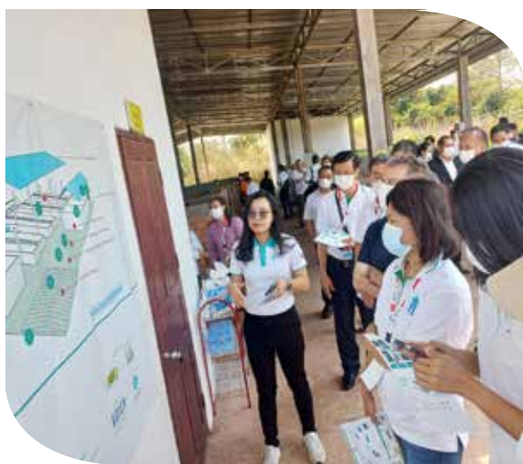
Participants visited the solid waste treatment plan.

Funded by Swiss Agency for Development and Cooperation, the event successfully gathered around 100 city and local government officials from Cambodia (Phnom Penh, Kampong Cham, National League of Commune-NLC), Lao PDR (Vientiane, Luang Prabang, Pakse, Thakek, Kaysone), Thailand (Mukhdahan, Nong Khai), and Viet Nam (The Association of Cities of Vietnam-ACVN) who shared a common vision of inclusive and green urban development. The delegates fostered collaborative approaches to developing economic clusters by creating a competitive, interconnected, and sustainable network of cities and local governments.