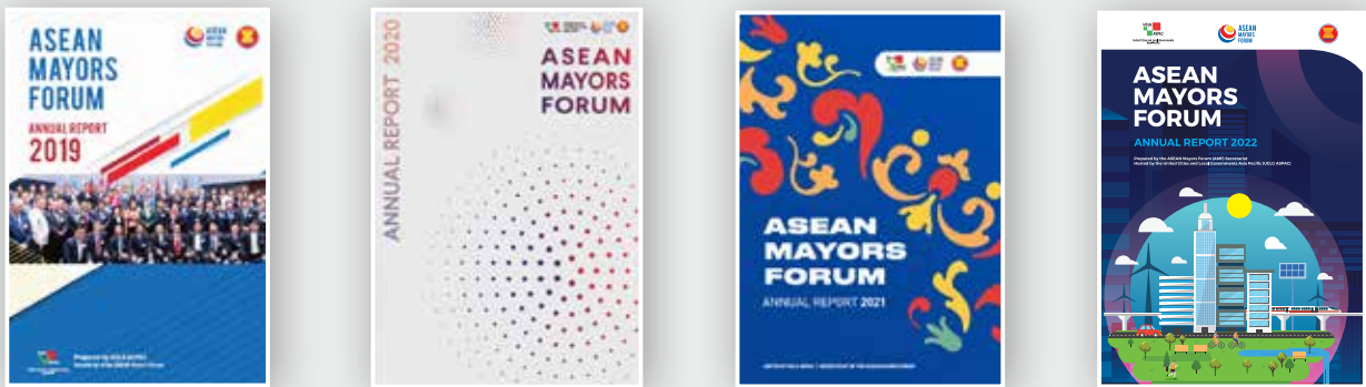
AMF Annual Reports