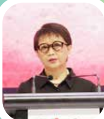
H.E. Retno L.P. Marsudi emphasised that people should be the core of governments' work.

Dr. Kao Kim Hourn , Secretary General of ASEAN, stated how the ASEAN Smart City Network (ASCN) and ASEAN Sustainable Urbanisation Strategy (ASUS) complement each other in catalysing opportunities for ASEAN cities. "For innovative, inclusive, and sustainable urban development, cities will therefore need to find the right combination of technology, policy, and partners." He recognised the vital role of cities in spearheading action needed towards sustainable development and the need for ASEAN Member States to build their capacity to promote pathways toward low carbon and climate resilient ASEAN. He concluded his message by acknowledging how MGMAC and AMF can be credible platforms to deepen collaboration and partnership among the ASEAN cities and local governments as well as catalyse collective efforts in attaining the ASEAN Community Vision 2025 and beyond.