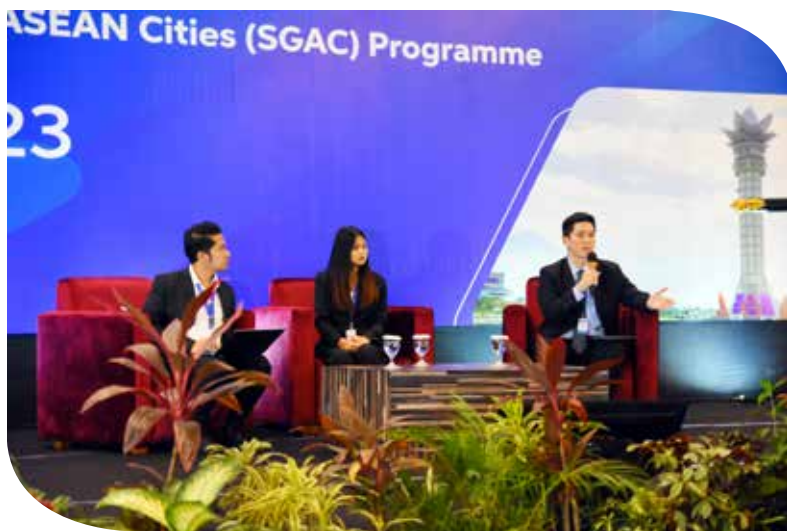
The AMF Secretariat contributed to moderating the City Showcasing and Knowledge Sharing Session on Urban Environment Management

The 2 nd CWS demonstrated the implementation of urban policy to investment, following a coherent circular system with the member states' policy. Furthermore, it also strengthened cities' capacity in subnational financing through discussion, practical training, and knowledge exchange, which leveraged financing in partnership with the private sector, financial institutions, and government entities. The focus of the 2 nd CWS was city project presentation to exchange information and expertise on opportunities for innovation and financing. For the practical pathway, participants were able to see waste management solutions of Banyumas Regency and learn the complete process of delivering the city-financed smart green projects.