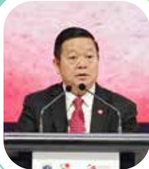
Dr. Kao Kim Hourn recognised the vital role of cities in spearheading action needed towards sustainable development.

Mr. Heru Budi Hartono , Acting Governor of Jakarta Special Capital Region, remarked that local governments have a big role to support the continued relevance of ASEAN in responding to regional and global challenges as well as strengthening ASEAN's position as the centre of regional economic growth for the prosperity of the ASEAN people and the world. He also mentioned that how MGMAC was first initiated by the Provincial Government of DKI of Jakarta during the leadership of Mr. Joko Widodo in 2013 and was since held annually following the ASEAN Chairmanship rotation.