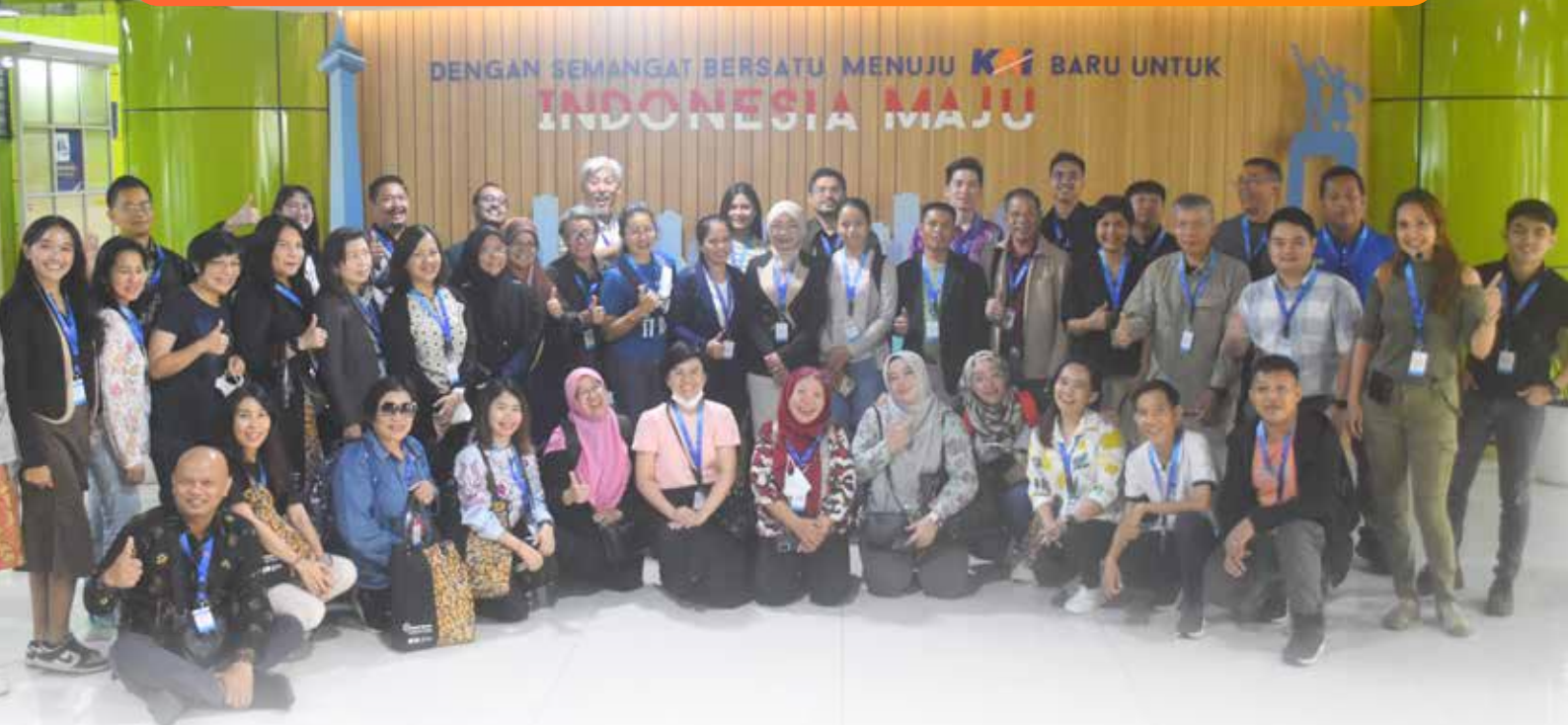
The participants of Smart Green ASEAN Cities: City Windows Event 2023

UCLG ASPAC, as the Secretariat of the ASEAN Mayors Forum (AMF), supported the 2 nd City Windows Series (CWS), a high-level event held as part of the Smart Green ASEAN Cities (SGAC) programme funded by the European Union (EU). This 2 nd CWS contributed to enhancing the knowledge of ASEAN cities to finance their smart and green city development initiatives. Since 2022, UCLG ASPAC and the UN Capital Development Fund (UNCDF) have collaborated to implement SGAC to promote more sustainable urbanisation in the ASEAN cities so that green and smart city solutions can be adopted in the ASEAN region.