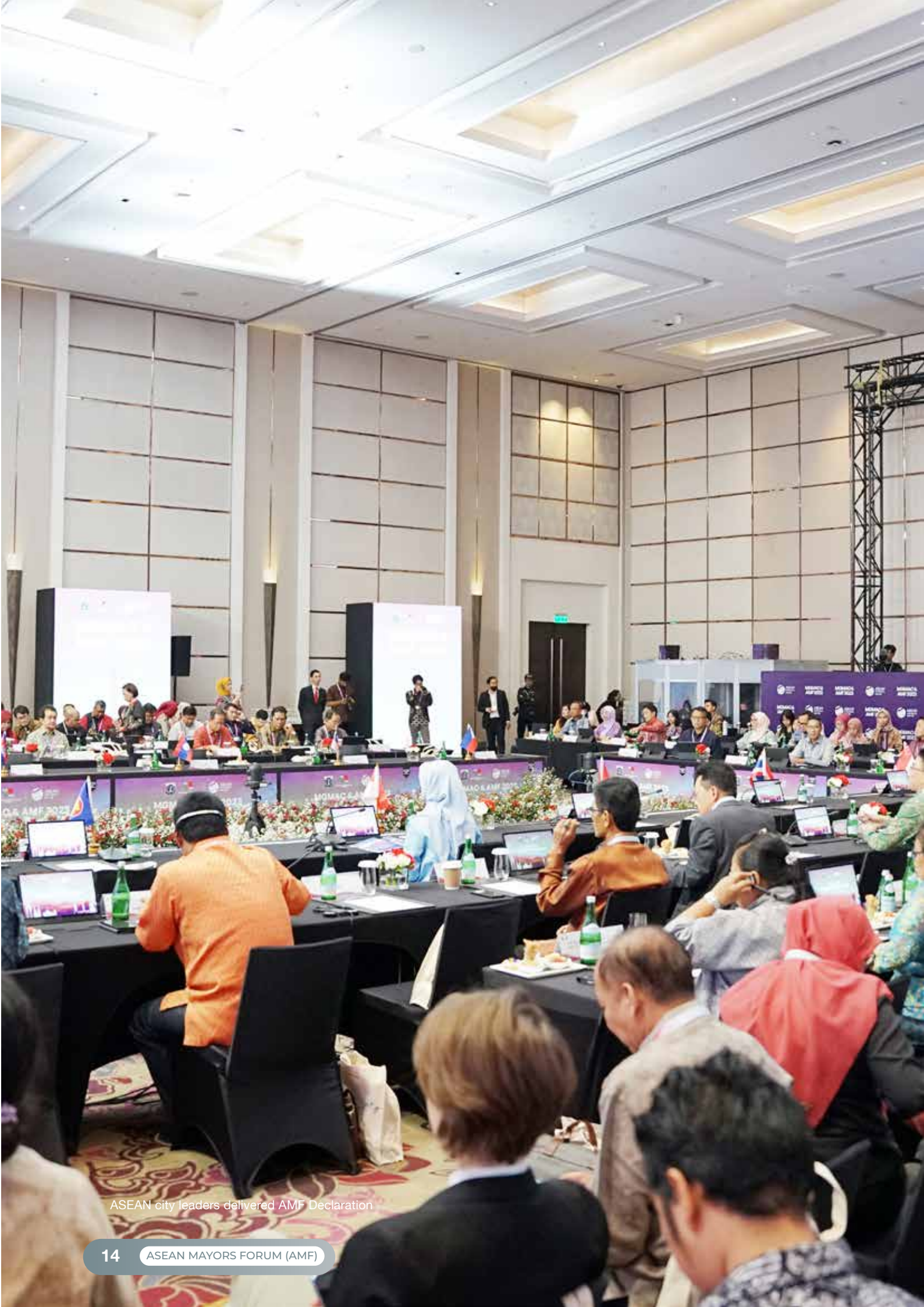
ASEAN city leaders delivered AMF Declaration