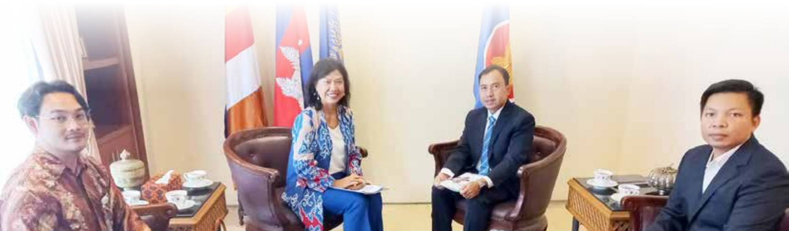
Courtesy visit of Secretary General to the CPR of Cambodia on 23 June 2024.

Referring to the "ASEAN Matters: Epicentrum of Growth" motto as the theme, we will always be ready to contribute to revitalising the collaboration spirit consistently throughout the works and achieve the goal of building ASEAN Communities and meet ASEAN COMMUNITY VISION 2025.