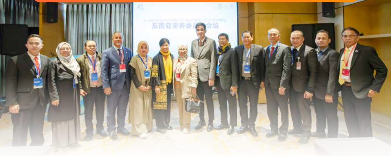
ASEAN City leaders attended the Southeast Asia Standing Committee Meeting at UCLG ASPAC-Yiwu Congress