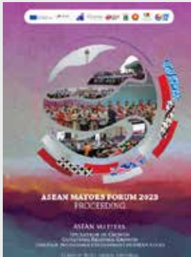
AMF Proceeding Report 2023