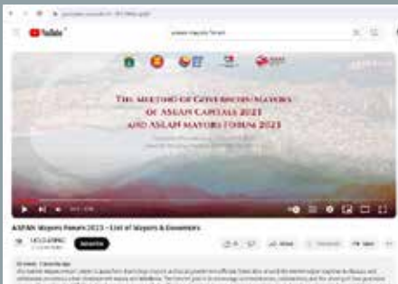
AMF 2023 Mayoral Video

Mayoral video profile has been produced to introduce the participating mayors during the AMF/MGMAC 2023. Aside from commercials, pamphlets, reports, and social media posts, the video profile is one of the most important ways to introduce and draw larger attention, and effective promotion to AMF networks.