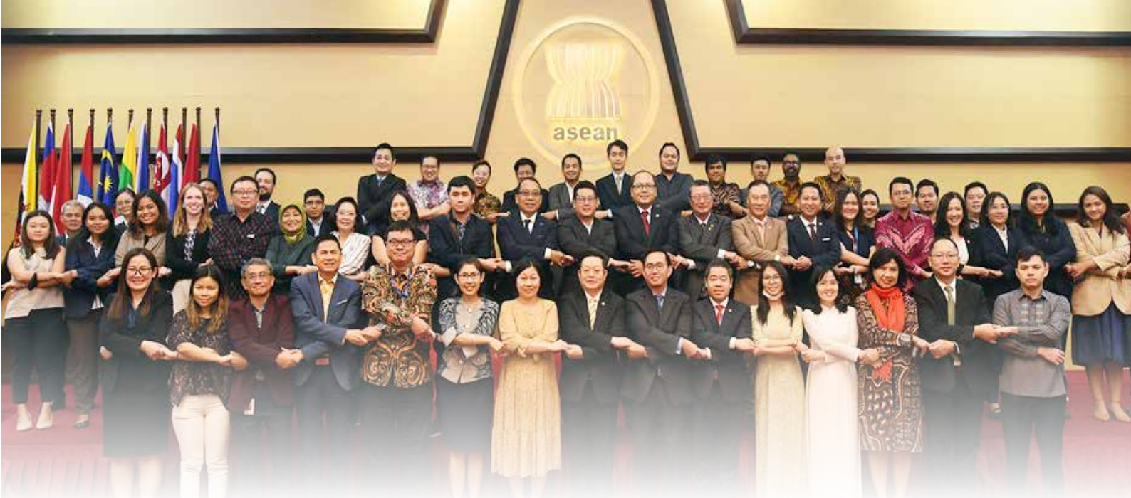
The gathering of Entities Associated with ASEAN 2023