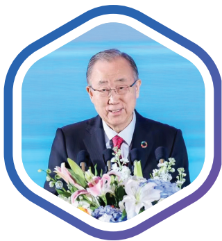
Mr. Ban Ki-Moon delivered a keynote speech at the Opening Ceremony.

Mr. Ban Ki-Moon, 8 th Secretary General of the United Nations and Chairman of the Boao Forum, recognised that unity and cooperation remain critical to address the numerous challenges to humanity. He added that UCLG is an important platform for multilateral exchanges and cooperation of cities in the world.