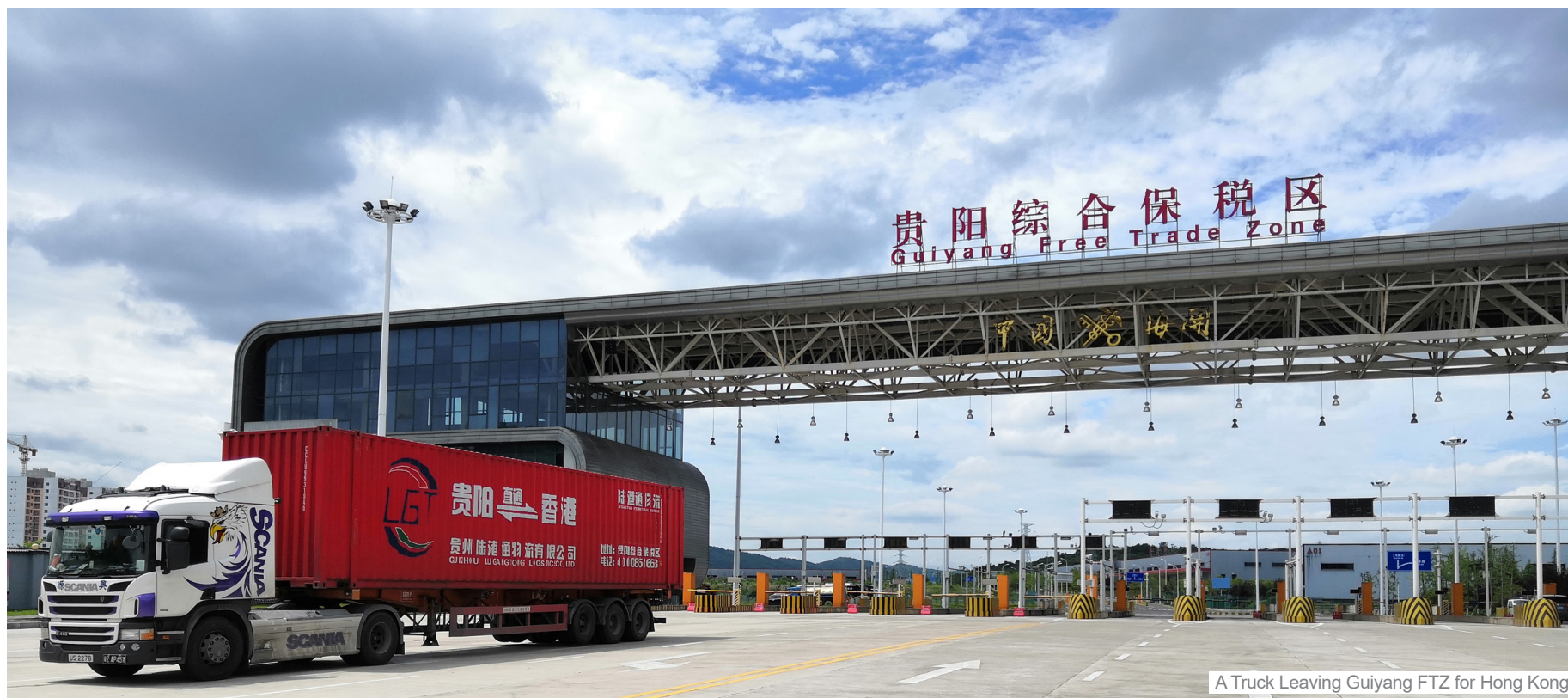
A Truck Leaving Guiyang FTZ for Hong Kong

Eight authorities including the Ministry of Commerce and the National Development and Reform Commission decided to set up 29 national import promotion and innovation demonstration zones. Guiyang Free Trade Zone (FTZ) was included in the list, becoming the first in Guizhou Province to receive such a designation. These demonstration zones are expected to play an exemplary role in two aspects: trade promotion (i.e. promotion of imports, industries, and consumption) and trade innovation (i.e. innovation in trade policies, services, and models).