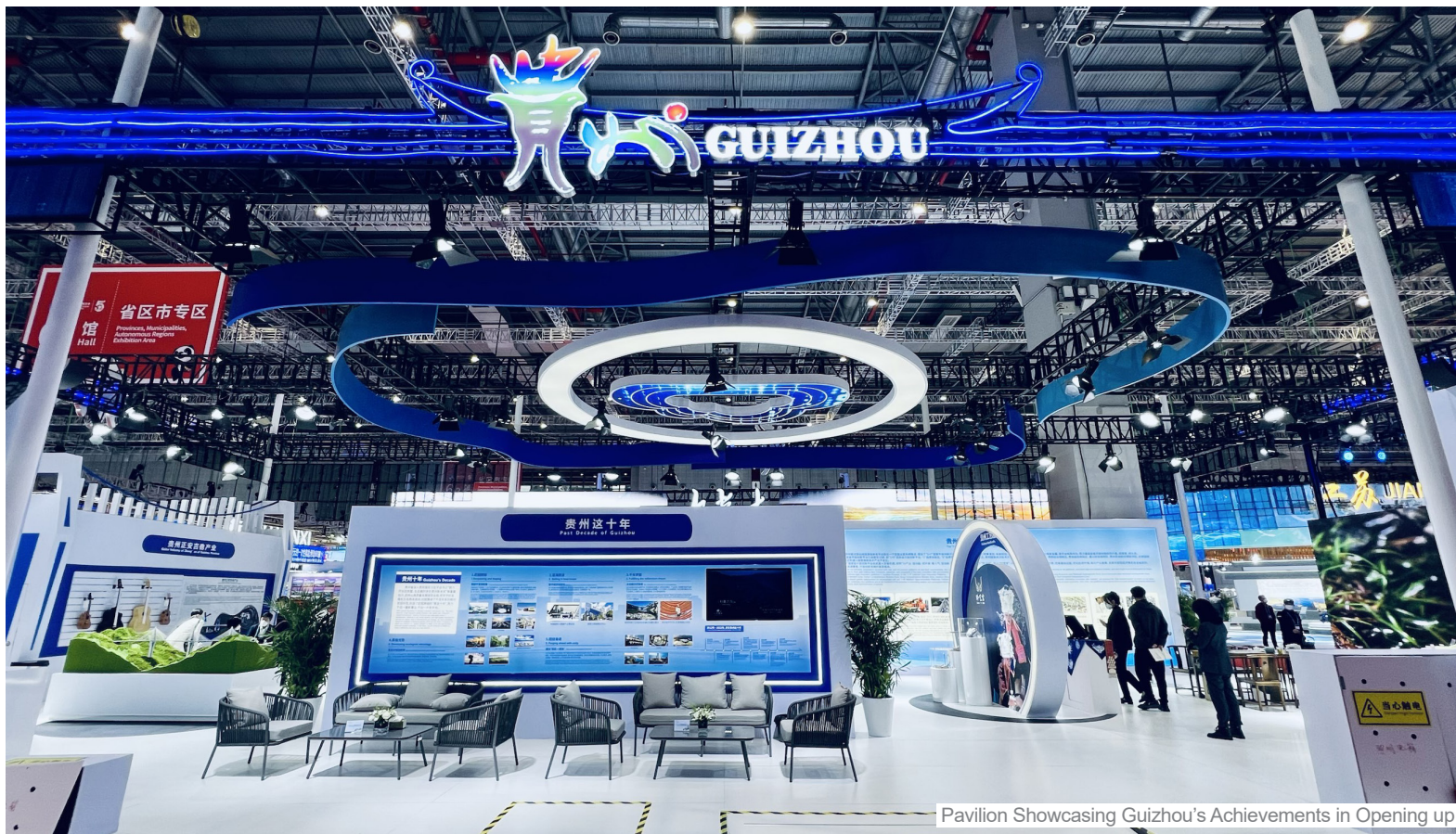
Pavilion Showcasing Guizhou's Achievements in Opening up

A fascinating array of products ranging from Guizhou tea, Lao Gan Ma, big data, to chassis for automated driving were on display at the fifth China International Import Expo (CIIE) held in Shanghai. The Expo offered guests from all over the world a glimpse into “colorful Guizhou” and “cool Guiyang”, acting as a great opportunity to boost economic cooperation and common development.