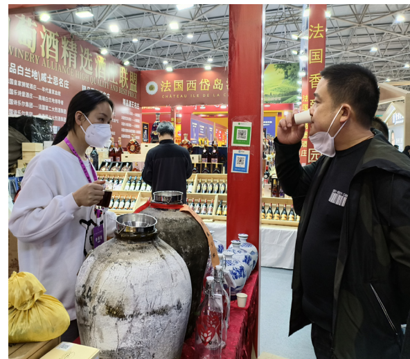
▲ Exhibitors Introducing Alcoholic Beverages

Construction commenced for the CIABE City. Located in Guiyang Southwest International Trade City, the CIABE City will be developed in three phases. In the first two phases, commercial facilities with an area of about 300,000 m 2 and 700,000 m 2 , respectively, will be completed. The third phase will involve the construction of an industrial park with about 333,000 m 2 . After completion, the CIABE City expects to bring together local sauce-flavor liquors as well as other famous alcoholic beverages from home and abroad, presenting a panorama of the global wine industry.