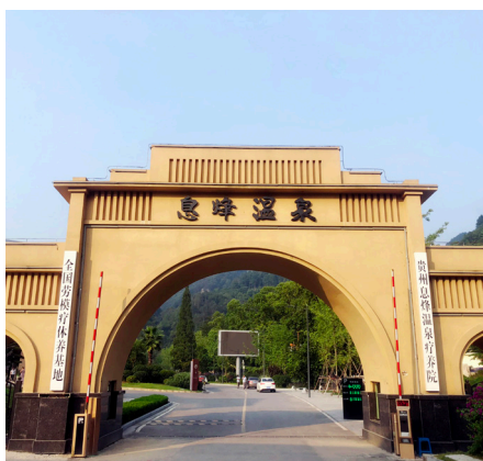
▲Xifeng Hot Spring

Xifeng Hot Spring is located in Wenquan Town, Xifeng County, 111 kilometers from downtown Guiyang. It is one of the eight most famous hot spring sites in China and recognized by some as the best. According to test results, the hot spring here is a heavy- \text{CaCO}_3 radon spring with metasilicates and strontium. The water offers many health benefits and stays at 53-56°C throughout the year.