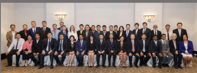
Participants from the 5th TFILUGP with Mr Desmond Lee (Second Minister for National Development).