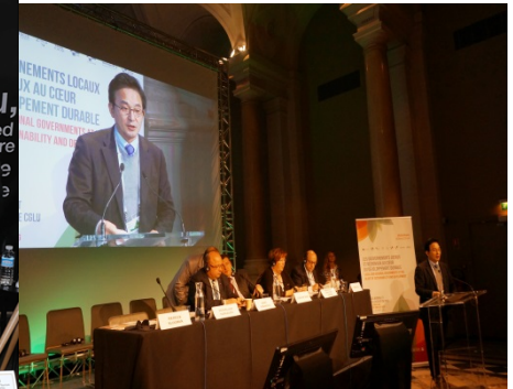
Capacity Building on Cultural Tourism Development in the Asia-Pacific Region 28 June ~ 1 July 2016, Jeju, Korea