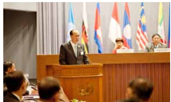
H.E. General Anupong Paochinda, Minister of Interior officially inaugurated the 5th ASEAN Mayors Forum.

Pol. Gen. Aswin Kwanmuang, Governor of Bangkok, extended his warm welcome remarks to all the participants and stated that “the 5 th AMF which is organised under the theme Driving Local Actions for Sustainable and Inclusive Growth does not only serve as a platform for ASEAN Mayors and their partners to exchange and discuss their local development experience, but also demonstrates BMA’s commitment on international cooperation to strengthen local governments’ position and capacities in enhancing sustainable development at all national and regional levels, with people at the centre for the development process.”