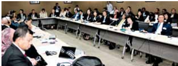
Participants during the breakout group discussion to discuss the roles of smart technologies in urban development and ASEAN's cooperation.