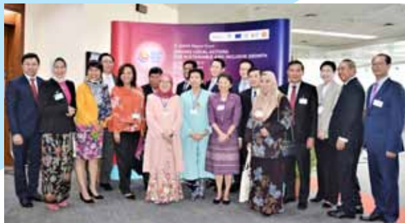
Committee of Permanent Representatives (CPR) to ASEAN visited the Forum and held an interface meeting with Mayor representatives to discuss how the work to promote sustainable development at the local and regional levels can complement each other.

To better connect ASEAN's work at the regional and local level, the first interface working lunch meeting between ASEAN Mayors and Committee of Permanent Representatives to ASEAN, was hosted by BMA to exchange about their work and discuss potential areas where they can support each other in order to accelerate the implementation progress of ASEAN's cooperation frameworks and ensure that the benefits are triggered down to local level. As AMF has received the accreditation from ASEAN as the first local governments entity affiliated with ASEAN, there are opportunities that AMF can gain.