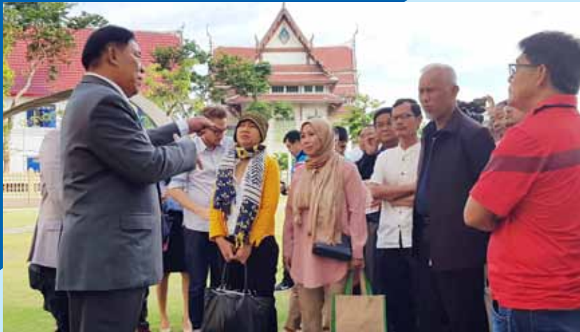
Pol. Gen. Aswin Kwanmuang, Governor of Bangkok welcomed ASEAN Mayors during the technical visit to the Museum of Discovery.

On the last day, ASEAN Mayors conducted a technical visit, welcomed by Pol. Gen. Aswin Kwanmuang, Governor of Bangkok and Mr. Kriangyos Sudlabha, Deputy Governor of Bangkok. The participants first visited the Museum of Siam Discovery to appreciate the national identity and history of Thai people and their relationships with neighboring countries, through a series of interactive exhibits. Another site visited was Sanam Chai MRT Station, designed by a prominent architect to showcase unique cultural landscapes and was built to resemble a Rattanakosin-style stateroom.