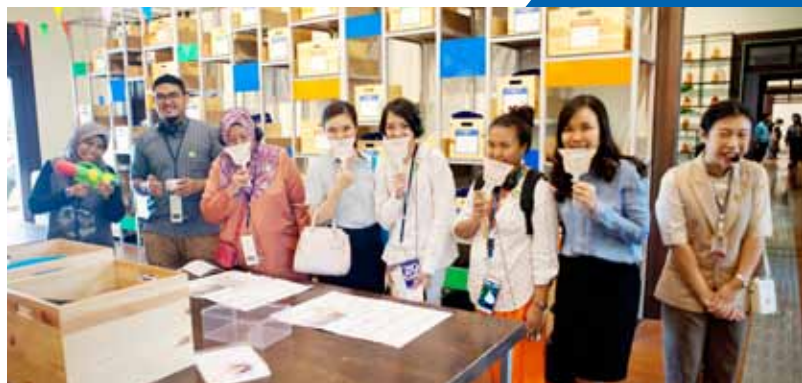
Participants appreciated the Museum of Siam Discovery where they enjoyed fun and innovative way of learning about Thailand's history, culture and neighbouring countries.