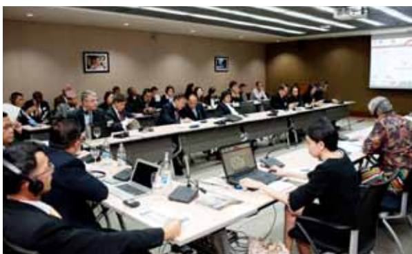
Breakout session to discuss the complementarities between ASEAN Vision 2025 & UN 2030 Agenda, progress on SDGs localisation and how to accelerate the progress.

The session focused on the challenge of localising the SDGs, stemming from the government centralisation, lack of authority and limited funding. Local governments find themselves without autonomy and authority, hence limited resources and capacity to plan, implement and engage with stakeholders. Moreover, Mayors face a lack of coordination and collaboration among city, provincial, and national levels – as well as other stakeholder groups. There is also a need for disaggregated data to support systematic planning. Among the biggest challenges for local governments is to identify proper local and feasible technology that can provide real solutions as well as the ways to mobilise financial resources for sustainable development.