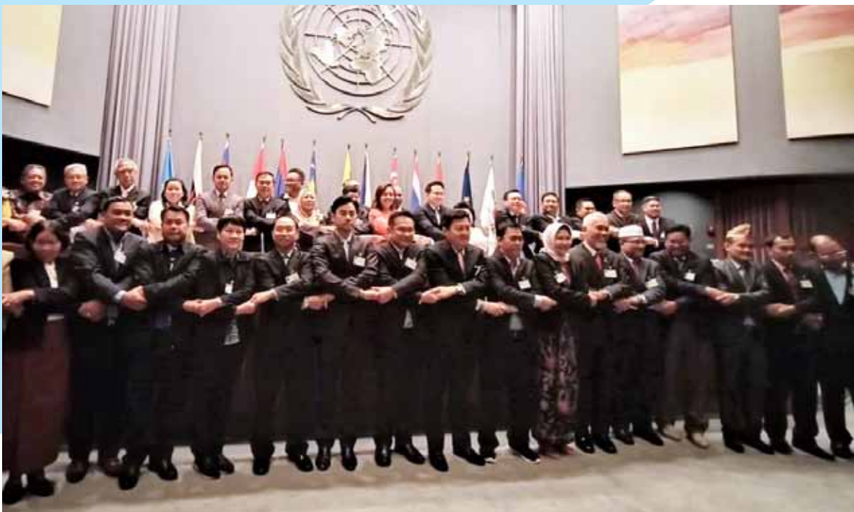
Mayors from ASEAN Member States pledged their commitment to work together towards sustainable development and inclusive growth at the 5 th ASEAN Mayors Forum, organised in Bangkok, Thailand, 26-28 August 2019

The AMF has been advocating for local governments' indispensable roles and contributions to the ASEAN and global development, notably the UN SDGs, the New Urban Agenda (NUA), the Paris Agreement on Climate Change and the Sendai Framework for Disaster Risk Reduction (SFDRR). The 5 th AMF served as a platform for discussions among ASEAN's local political leaders, national policy makers, international development partners