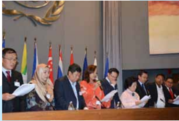
ASEAN Mayors jointly read the ASEAN Mayors' Declaration on Driving Local Actions for Sustainable and Inclusive Growth for the adoption.

The 5 th AMF successfully concluded with the adoption of the ASEAN Mayors' Declaration on Driving Local Actions for Sustainable and Inclusive Growth, which outlines concrete areas for further collaboration among ASEAN Mayors. The Joint Declaration of the ASEAN-Republic of Korea Mayors on the 30 th Anniversary of ASEAN-ROK Dialogue Relations was also adopted at the event to mark this auspicious occasion and in the coming up of the Commemorative Summit to be hosted by Busan in November this year. Both sides are now working to identify follow-up actions to realise the vision set out in the first ASEAN-ROK Mayors Joint Declaration.