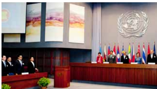
The participants stood up for the ASEAN anthem during the opening ceremony.

The remarks were also delivered by H.E. Mr. Pirkka Tapiola, Ambassador of the European Union to Thailand, who outlined common challenges and opportunities that European and ASEAN Cities are facing. He called on local governments to ensure that policies are planned according to data and scientific evidence. Ambassador Pirkka Tapiola urged the Mayors that "You must engage all stakeholders in their design and implementation to achieve inclusive and equal sustainable urban development for all citizens. The sessions planned for these next two days are a privileged space. You have the chance to gather, to share and learn from each other, to compare challenges, and to rethink policies and actions with citizens at their centre."