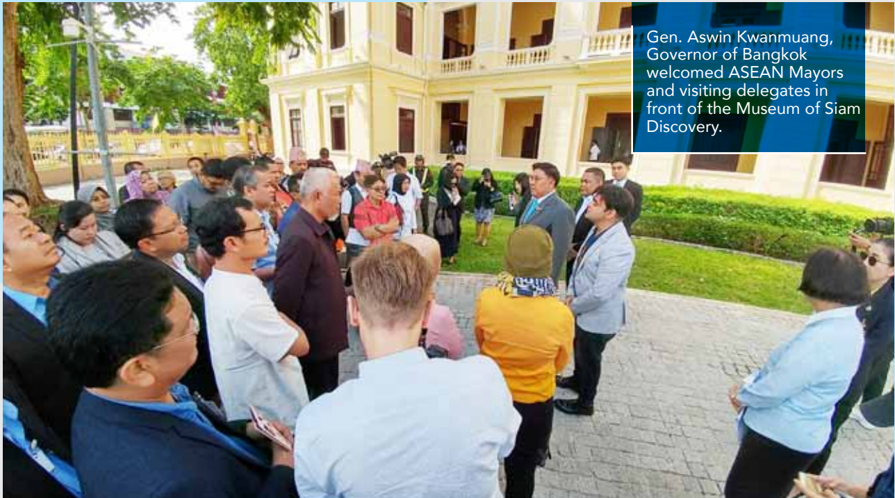
Gen. Aswin Kwanmuang, Governor of Bangkok welcomed ASEAN Mayors and visiting delegates in front of the Museum of Siam Discovery.